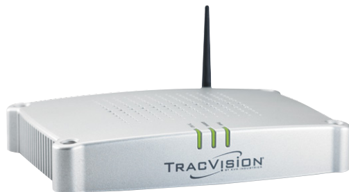
The TracVision TV-Hub is a streamlined IP-enabled belowdecks unit that makes the TV8 extremely easy to use

Designed for worldwide use and ease of operation, the TracVision TV8 has automatic skew control and integrated GPS for the fastest satellite acquisition and unmatched tracking. The TV-Hub enables trouble-free setup, easy system monitoring, multi-satellite configuration, and easy switching between satellite TV services. Plus, the system supports automatic satellite switching from the remote control and multiple TVs and receivers so everyone onboard can enjoy the TV programs they want.